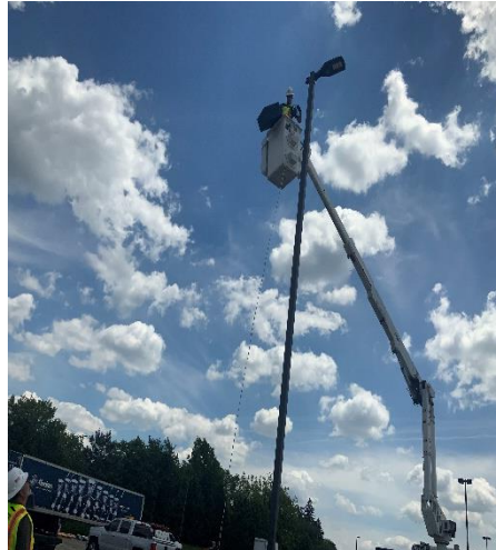
Old Pole Lighting