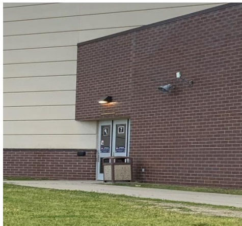
New Lighting Installed Over Doors