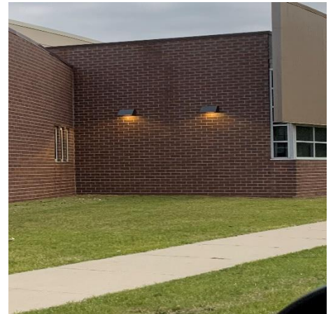
Other New Lighting Installation