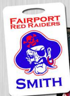
Logo Bag Tag